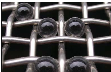
Glass calibration microspheres for calibrating sieves

A more serious concern is that some manufacturers have put the wrong sieve cloth in the frame.