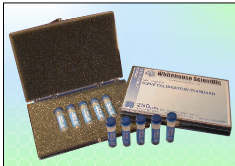
'Single-shot' polydisperse particle size reference standards