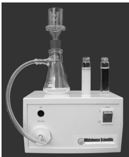
Fig.2 Suspension filter tester for 2-Dimension filters

The experiment was then repeated with the bag filters, table 2. An interesting observation on the nominal 25µm filter was that, although the 16 – 25µm beads failed to pass, about 45% of the 45 – 62µm filter standard passed. The phenomenon was also seen with the larger filters, eg. 16 – 25µm would not pass the 200µm filter, but about 50% of a 180 – 248µm standard passed. The mechanism of the dry filtration does not therefore depend on the physical size of the pores for these non-wovens.