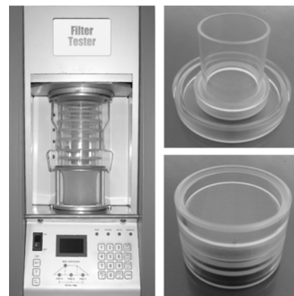
Figure.1 Sonic filter tester and holders for 2-Dimensional filters

The Sonic Filter Tester was used for the dry testing of filter media, figure 1. Intense oscillating air currents fluidise the reference glass microspheres through the filter. From the weight of microspheres passing, the cut point of the filter can be determined. The minimum cut point depends on the geometry of the filter medium. 2-Dimensional electroformed sieves can be measured down to 5 \mu\text{m} but as filter depth increases and porosity decreases, the lower limit increases to approximately